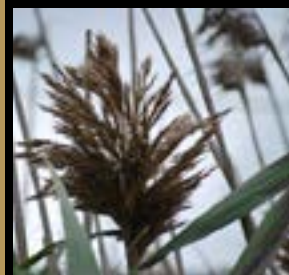
Invasive Species - Phragmites "Phragmites Australis"

Environmental Protection Agency - Green Acres Toolkit