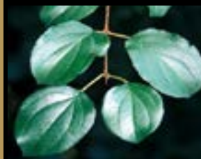
Invasive Species - Common Buckthorn "Rhamnus Cathartica"